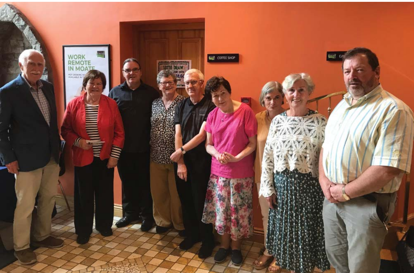
Moate Museum & Historical Society 50th Anniversary Organising Committee with Federation members