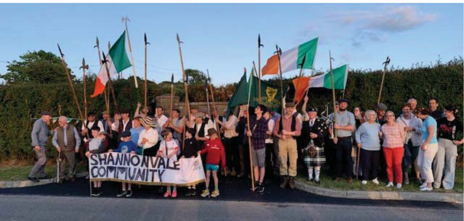
Duchas Clonakilty Heritage Group celebrating at the site of the Big Cross 1798 Battle