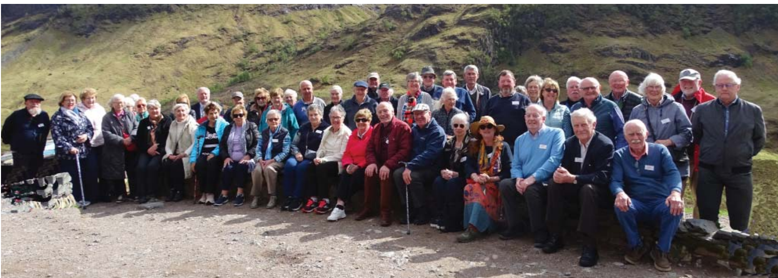
Group at the Valley of Glencoe, Scotland