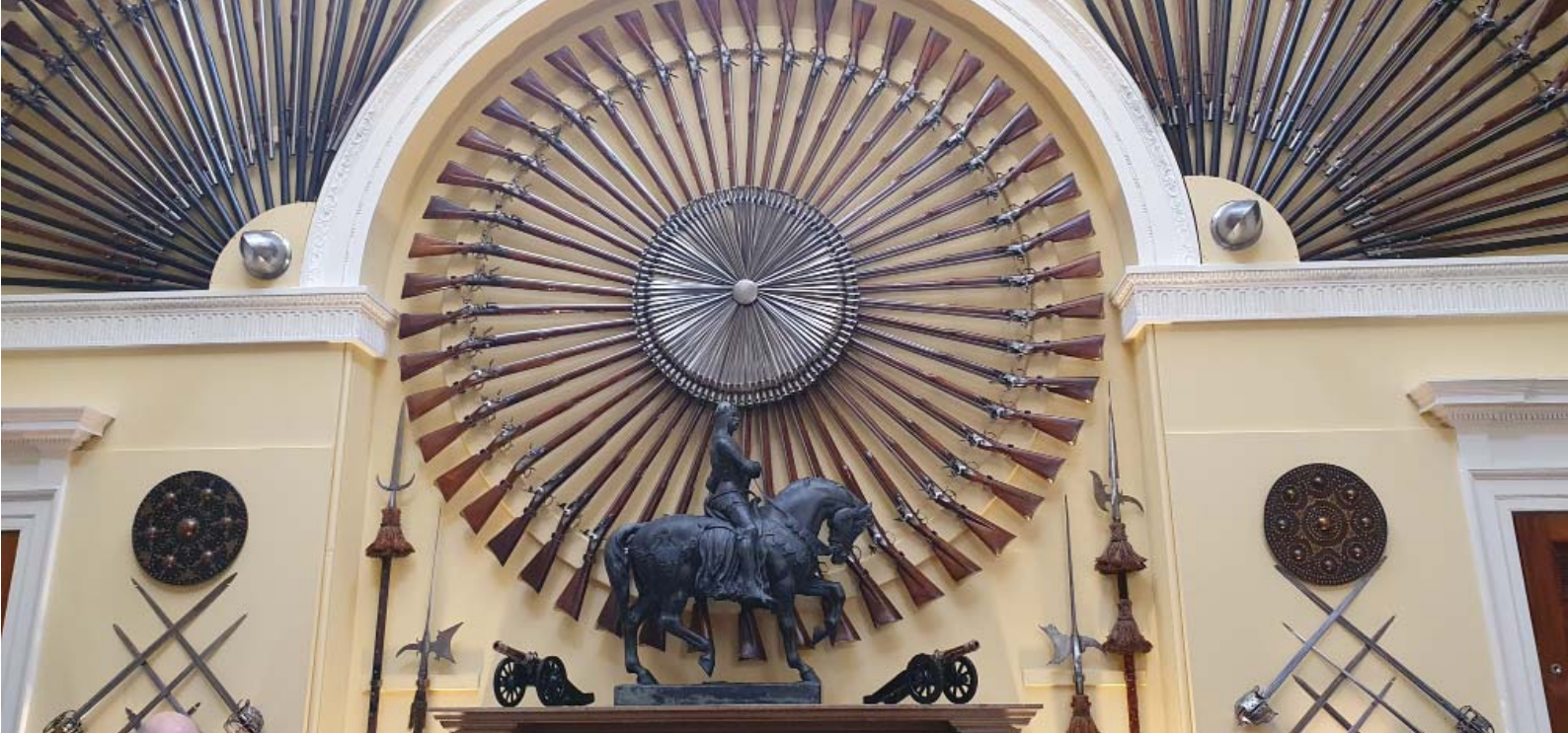
Gun Room, Inverary Castle