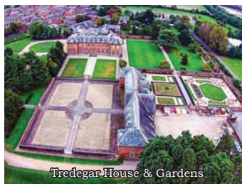
Tredegar House & Gardens

In December 2011 the National Trust signed an agreement with Newport City Council to take on the management of the building, as well as the 90 acres of gardens and parkland, on a 50-year lease from 2012.